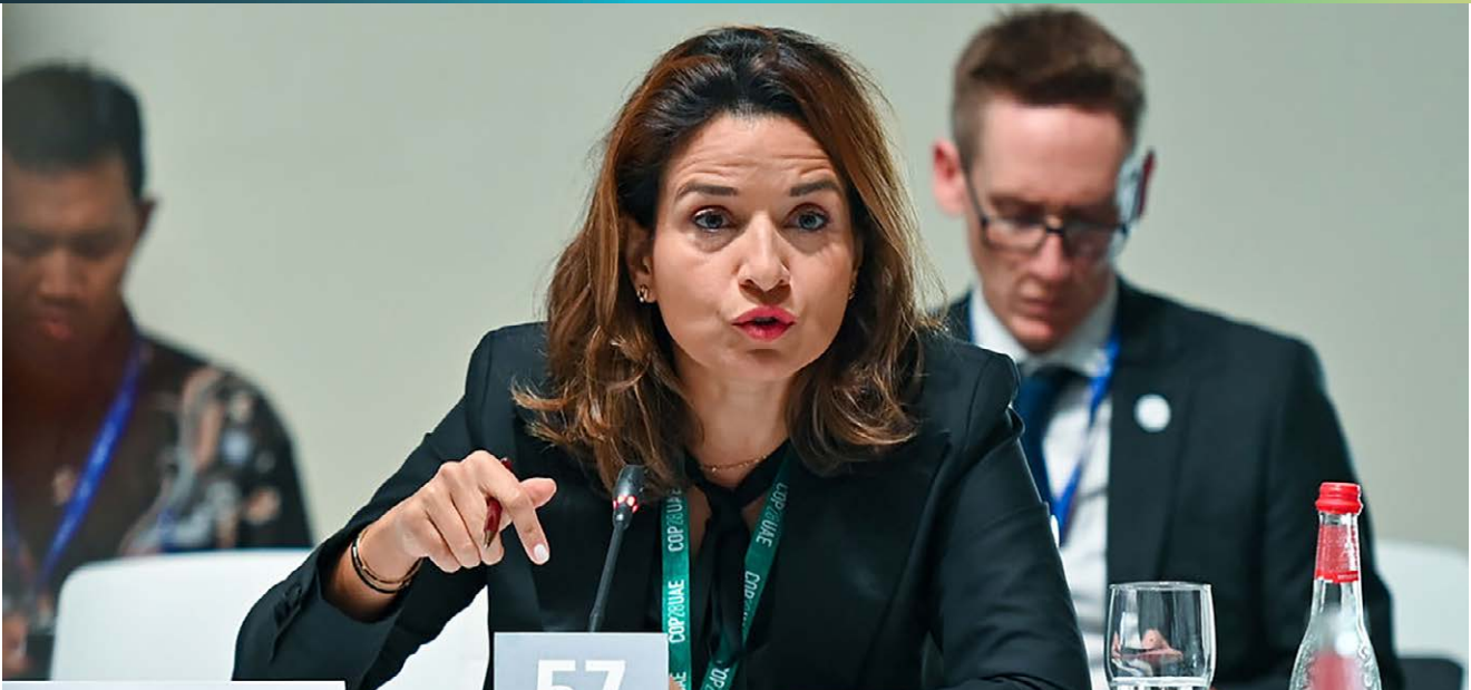
The 8th ETC Ministerial at COP28

H.E. Dr Leila Benali, Minister of Energy Transition and Sustainable Development (Morocco)