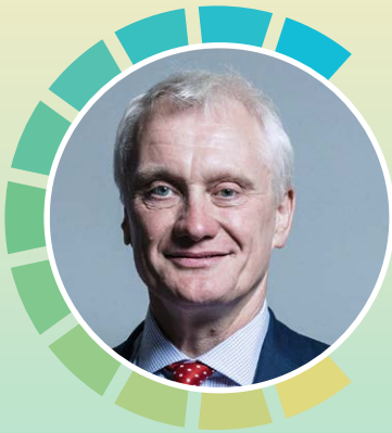
Rt Hon Graham Stuart

Minister of State for Energy Security and Net Zero, United Kingdom