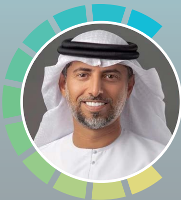
H.E. Minister Suhail Al Mazrouei

Minister of Energy & Infrastructure, United Arab Emirates