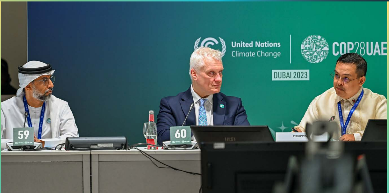
The three co-chairs of the 8th ETC Ministerial at COP28